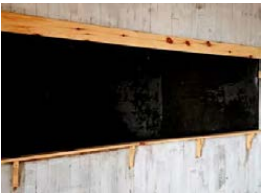
Installed blackboard adds authenticity to North Unity School based on historic documentation.