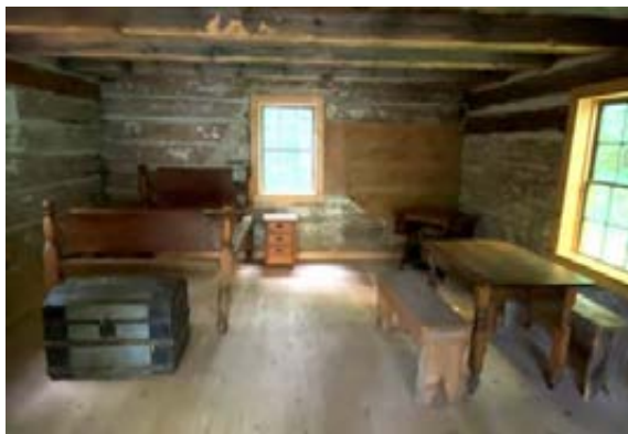
Antique furniture was placed in Kraitz cabin to suggest what the original cabin might have looked like.

Kraitz Cabin and North Unity School interiors were whitewashed to restore the historic look and protect the logs.