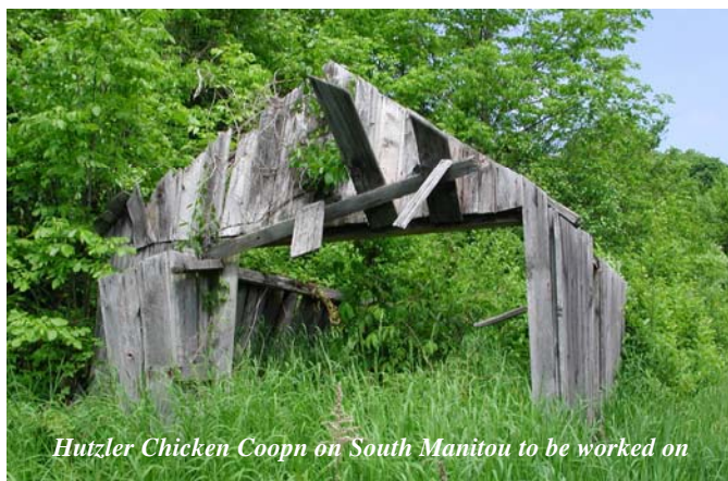
Hutzler Chicken Coopn on South Manitou to be worked on

Preserve Historic Sleeping Bear and the Manitou Island Memorial Society (MIMS) are pairing up to coordinate efforts, direct funding and support each other's projects on South Manitou Island. The two organizations have previously discussed ways to partner, sharing a common goal to preserve historic buildings, sites and landscapes on both North and South Manitou Islands. The stabilization and maintenance